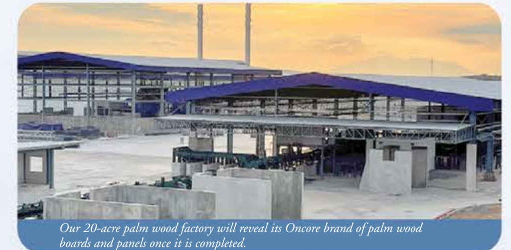
Our 20-acre palm wood factory will reveal its Oncore brand of palm wood boards and panels once it is completed.

"We should be steadfast in following our vision and mission, holding on to our core values."