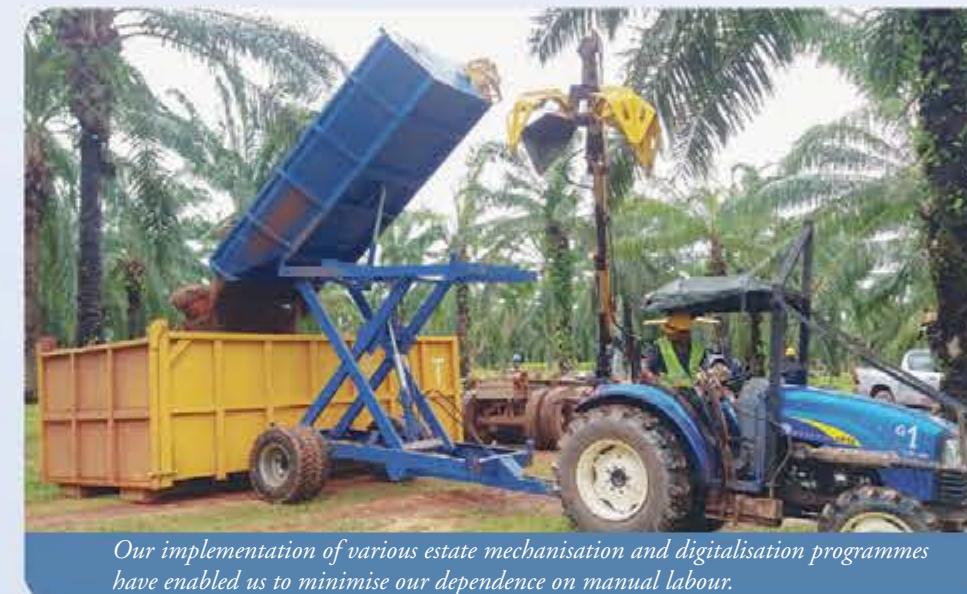
Our implementation of various estate mechanisation and digitalisation programmes have enabled us to minimise our dependence on manual labour.

However, there are still challenges in our implementation of the Five-Year Plan.