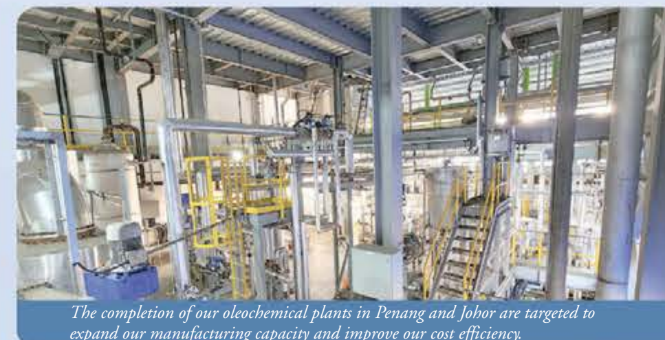
The completion of our oleochemical plants in Penang and Johor are targeted to expand our manufacturing capacity and improve our cost efficiency.

"We should be steadfast in following our vision and mission, holding on to our core values."