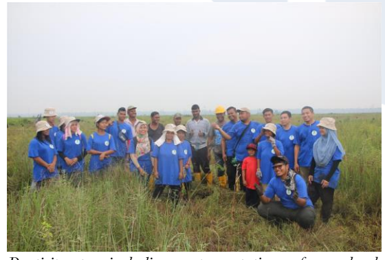
Participants including representatives from community, IOI, and GEC.

The first planting activity involving 0.5 ha was held on 15 July 2019 by both the community and IOI team. The remaining 9.5 hectare will be planted gradually until August 2019.