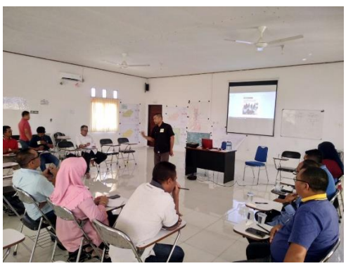
SIA training at PT SKS

A training on Social Impact Assessment (SIA) was conducted at PT SKS in July 2019 and was participated by about 19 employees in charge of community engagement. The training conducted to equip the trainees with knowledge on identification and handling of potential social impacts from the company's operations.