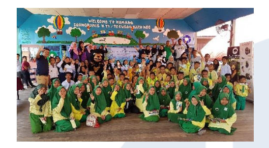
Activities and highlights of the day

IOI Plantation SPO Department (Sandakan Region) had organised its first Sustainability Outreach Programme (SOP) with three external partners including the Sabah Wildlife Department, the Rainforest Discovery Centre of the Sabah Forestry Department and the Bornean Sun Bear Conservation Centre on 25 April 2019.