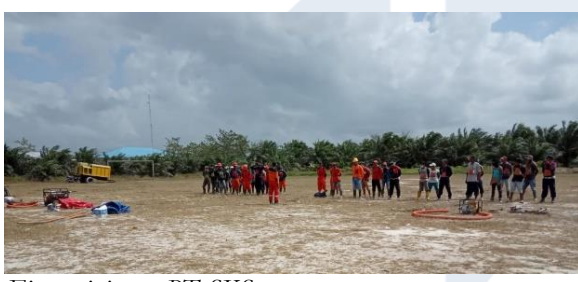
Fire training at PT SKS.

The employees were trained on fire preventive measures, roles and function of patrolling team, emergency response in the event of fire, etc.