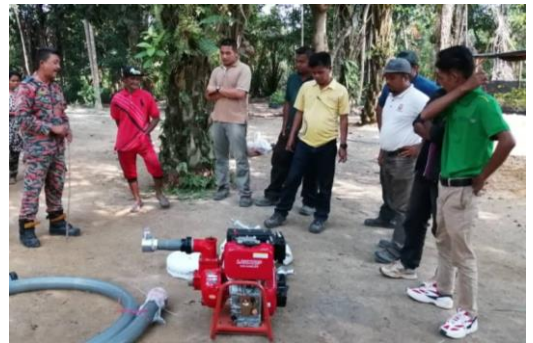
The Fire and Rescue Department (BOMBA) giving training to local community.

In addition, the firefighting equipment and Fire Danger Rating System have been fully functional. The fire prevention and emergency response training with the Orang Asli was planned in early July 2019. Continuous monitoring after the development of canal block was conducted to ensure proper water management.